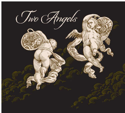
Red Hills, High Valley, CALIFORNIA